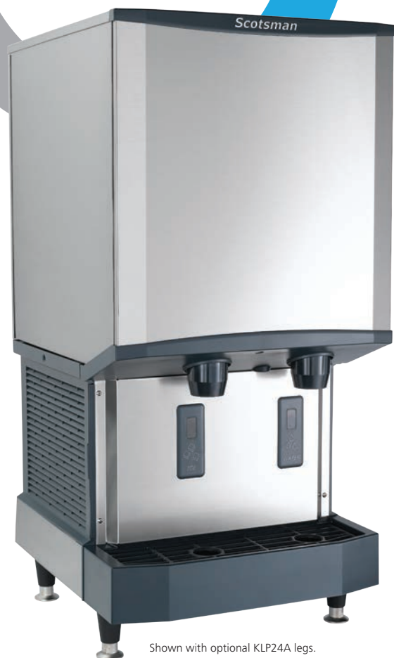
Shown with optional KLP24A legs.