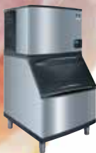
i-450 B-400 Bin