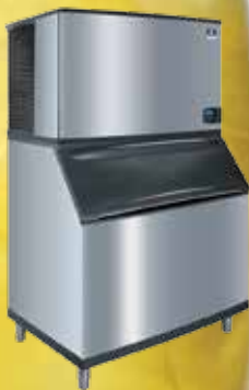
i-1406 B-970 Bin