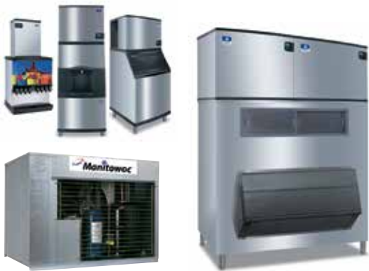
CVD Condensing Unit***