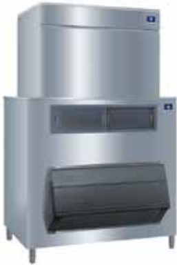
S-3300 F-1650 Bin