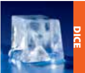
Available on all undercounters