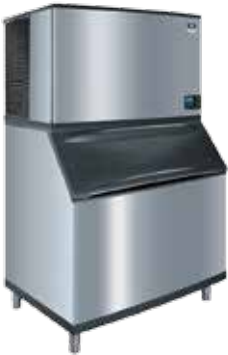
i-1800 B-970 Bin