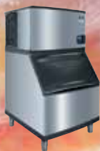
i-300 B-400 Bin