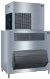
RF-2300 F-1650 Bin