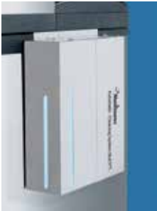
iAuCS (External Mounting)

Eliminates routine maintenance. iAuCS counts the number of ice-making cycles and, at a frequency you select, initiates a cleaning or sanitizing cycle... AUTOMATICALLY. Choose from 2-, 4-, or 12-week settings. Use with Indigo modulars.