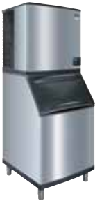
i-1106 B-570 Bin