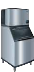
i-606 B-570 Bin