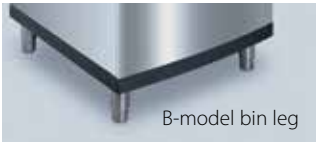
B-model bin leg