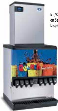
Ice/Beverage Series on Servend Beverage Dispenser