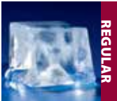
Available on i-500 and i-906