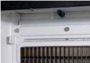
Ice machine equipped with LuminIce II Ice machine without LuminIce II

Creates “active air” by recirculating the air around the ice machine foodzone components to inhibit the growth of yeast, bacteria, and other common micro-organisms. For use with Indigo and NEO® series.