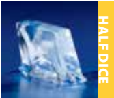
Available on U-140, U-190, U-240, and U-310

These compact ice cube machines are ideal for small-volume ice production, for limited-use needs, or as back-ups for larger machines. Specifically designed to fit beneath counters or in areas where floor space or height restrictions prohibit use of larger equipment. The petite size makes any of these models ideal for on-the-spot installations at coffee shops, stadium boxes, refreshment/break areas, or wherever limited ice needs require equipment with a small footprint.