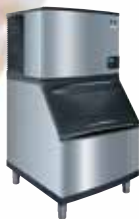
i-500 B-400 Bin