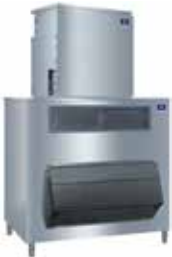
RFS-2378C F-1650 Bin