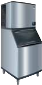
i-906 B-570 Bin