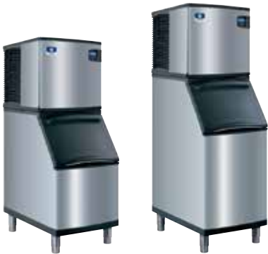
i-322 B-320 Bin