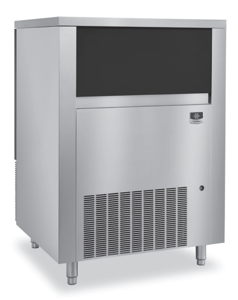
Model BG-0260 Large Gourmet Ice Machine