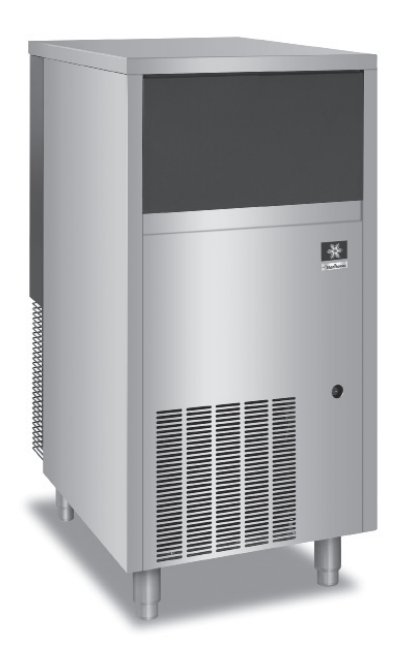
Model RF-0266A Flake Ice Machine