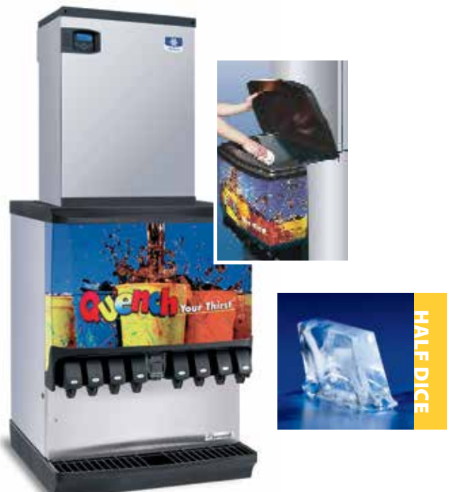
Ice/Beverage Series 1090C ice machine on Servend SV-250 beverage dispenser

This compact Ice/Beverage Series ice machine is available in high volume ice production capacities to satisfy nearly every beverage dispenser application at quick service restaurants, convenience stores, recreational or educational foodservice operations.