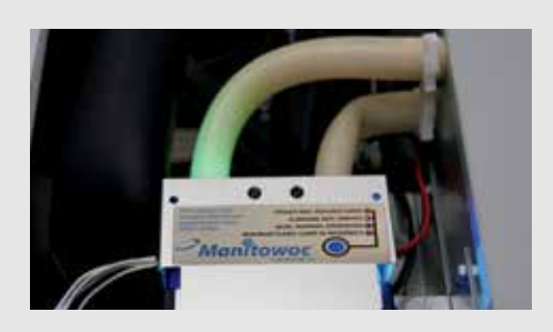
The LuminIce II space-saving design fits inside the ice machine so existing exterior clearances are not impacted. In addition, power for the unit is supplied through the ice machine's internal electrical supply so outlet space is conserved.

Available on both Indigo and NEO series ice machines, the optional LuminIce II Growth Inhibitor creates "active air" by recirculating the air inside the ice machine foodzone components to inhibit the growth of yeast, bacteria, and other common micro-organisms.