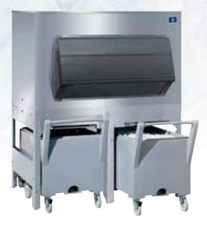
Ice Storage Bin and Cart System Includes two 240 lb. (109 ka) capacity carts with lids.

Featuring high-volume dispensing with patented "push-for-ice" rocking chute dispense mechanism and paddle wheel technology.