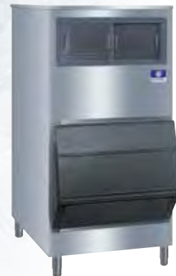
F-Style Large Capacity Ice Storage Bins

Available in 22" (55.9 cm), 30" (76.2 cm) and 48" (121.9 cm) widths.