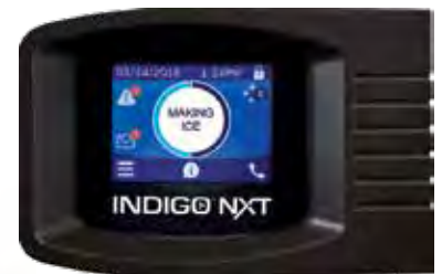
easyTouch ® Display