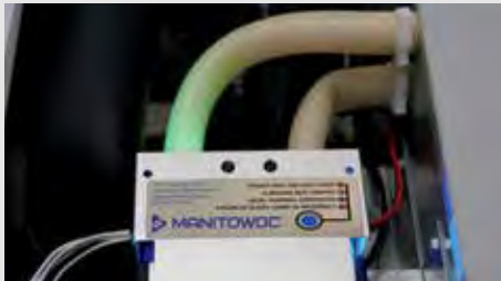
With LuminIce II

The LuminIce II space-saving design fits inside the ice machine so existing exterior clearances are not impacted. In addition, power for the unit is supplied through the ice machine's internal electrical supply so outlet space is conserved.