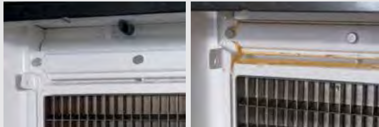
Without LuminIce II

The LuminIce II device runs quietly 24 hours a day keeping your ice machine cleaner and helping to relieve the stress and pain of frequent cleanings due to challenging foodservice environments where yeast, flour, and other contaminants create an environment favorable to growth. Reduced cleanings ultimately saves labor time, cost, and machine downtime during the cleaning process.