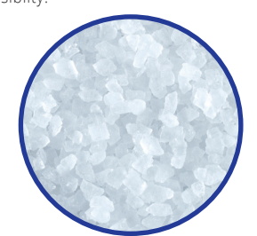
Ice shown actual size

Nugget ice consists of small pieces ranging from 3/8" to 1/2" in width and length on average. Offers a 85% ice to water ratio with a soft, chewable texture while still providing maximum cooling effect and great dispensibilty.