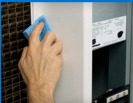
Rounded foodzone corners