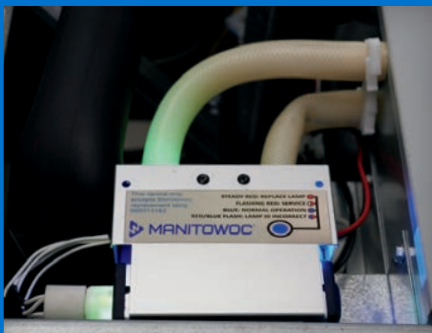
LuminIce II Growth Inhibitor accessory