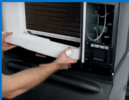
Removable water trough