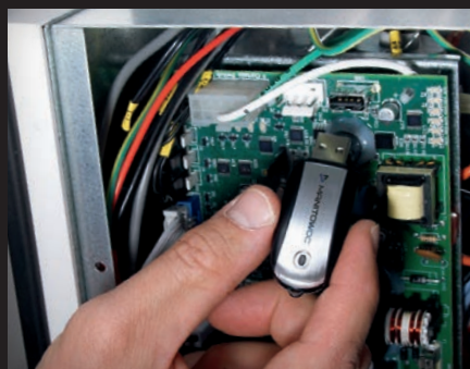
USB Port Firmware Updates