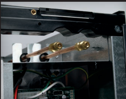
Easy Frontal Service Access Ports