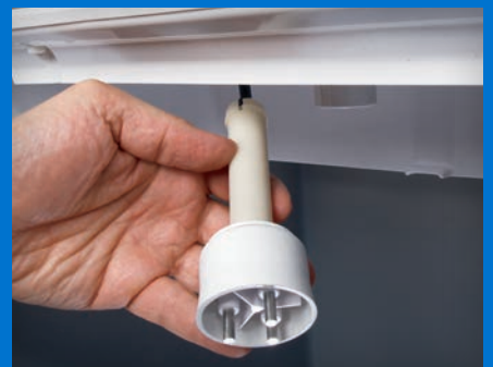
Snap-fit water probe