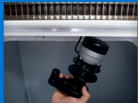
Snap-fit water pump