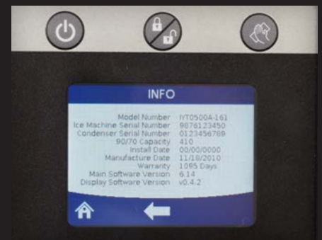
One touch machine info