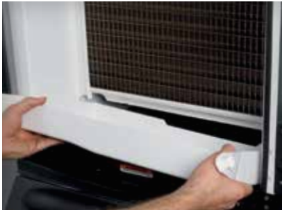
Removable water trough