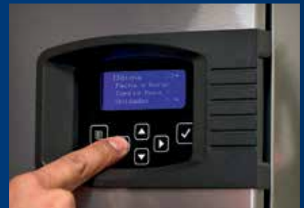
Full access bezel cover for easy access in non-public locations included with every machine