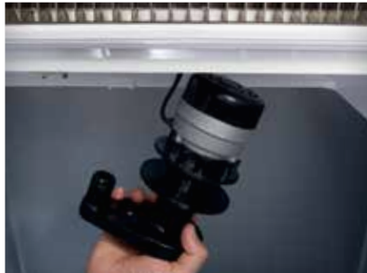
Snap-fit water pump