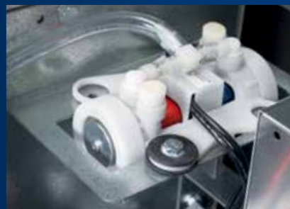
Patented Air Assist Harvest technology