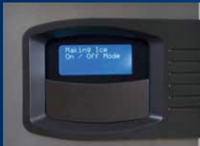
Standard button-cover bezel prevents unauthorized menu navigation in public areas