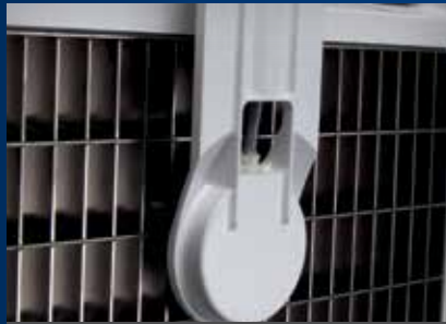
Acoustical Ice Sensor

Manitowoc's patented Air Assist Harvest technology speeds up the ice harvest cycle lowering overall energy use. The revolutionary acoustical ice-sensing technology accurately measures ice thickness for consistent cube formation creating a quality ice cube in less time.