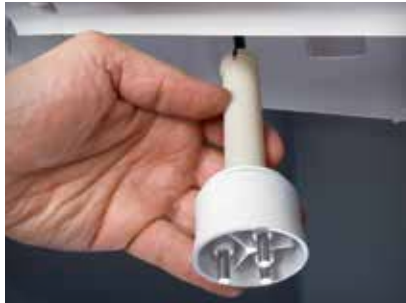
Snap-fit water probe