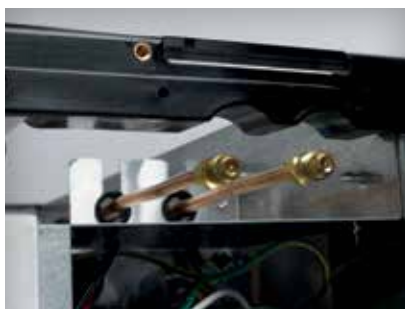
Easy frontal access to service ports