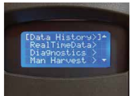
Service data display