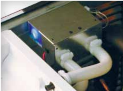
LuminIce Growth Inhibitor accessory

antimicrobial protection. Foodzone edges have rounded corners that wipe cleaner, easier. Our optional Automatic Cleaning System (iAuCS®) initiates a cleaning or sanitizing cycle to the evaporator AUTOMATICALLY at an interval you select, extending the time between full service cleanings. And Manitowoc's exclusive LuminIce® Growth Inhibitor accessory creates "active air" that passes over exposed foodzone components to inhibit the growth of yeast, bacteria and other common micro-organisms. So your Indigo stays cleaner, longer. That's intelligent design.