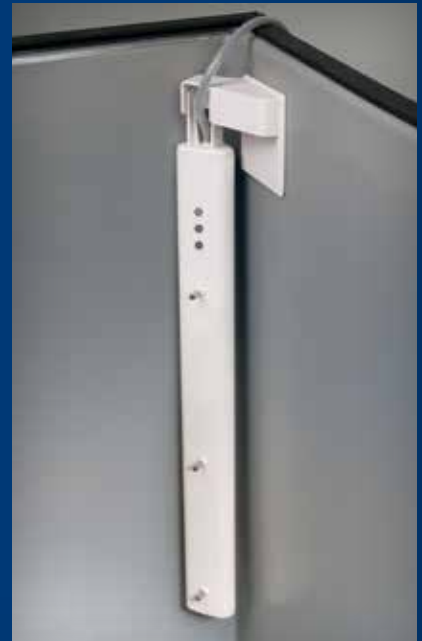
Bin Level Control Sensor