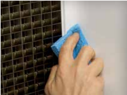
Rounded foodzone corners