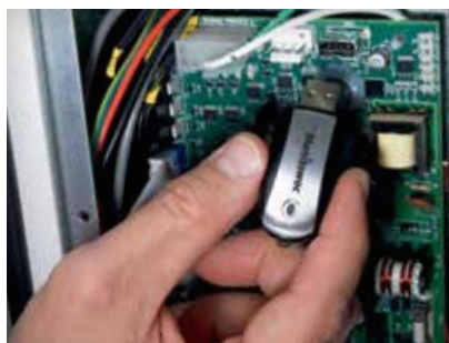
Firmware upgrades through USB port